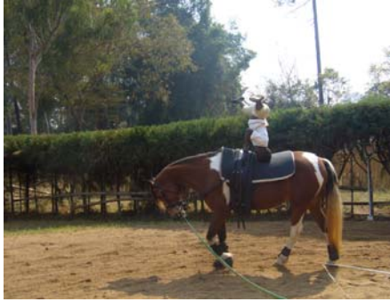
The Amazing Ginger, always patient and tolerant with anything.