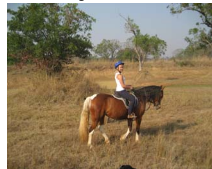
A hack and a Yack on the last day.