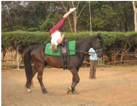
Working with Dekador - new moves and cantering