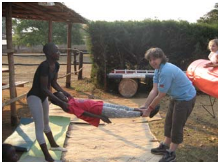
Hey, keep that tension!