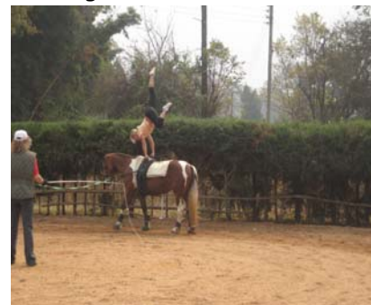
Hand stand time!