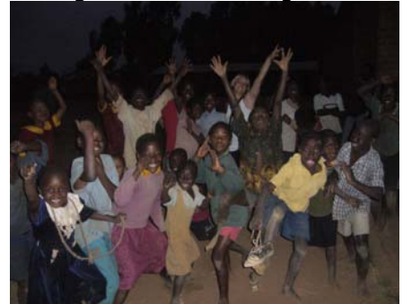
Dances with kids!!